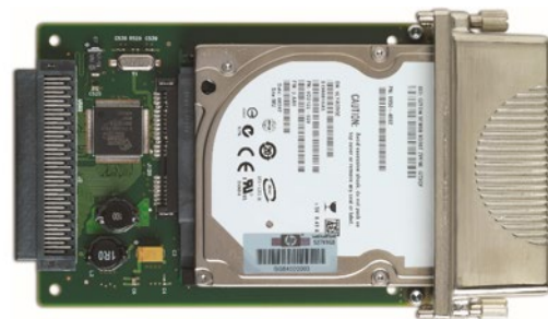
HP High-Performance Secure Hard Disk