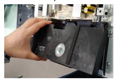
Remove the IR, WIFI module